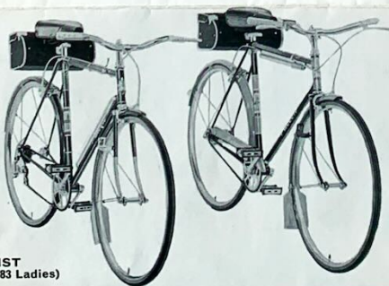
SUPER TOURIST (M.82 Gents, M.83 Ladies)